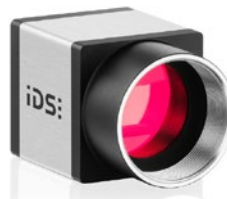
Endo CU 1/1,8" 5 MP