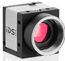
Endo CU1/2" 2,3 MP